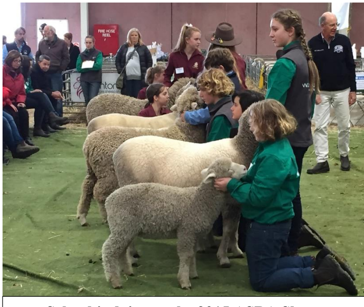
School judging at the 2015 ASBA Show.

on computers. UNE presented each student with a pen complete with a USB drive concealed on the end. As you can imagine they were a treasured possession!