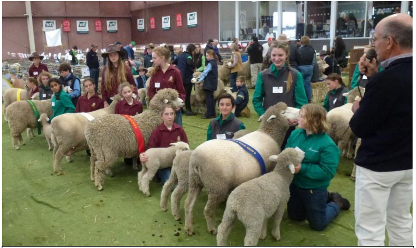
School judging at the 2015 ASBA Show.