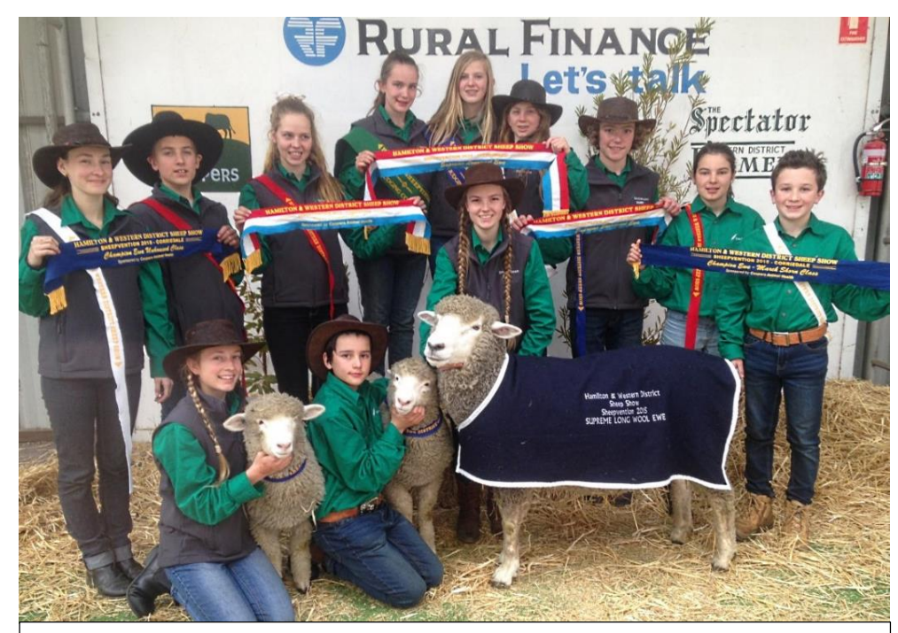
Woodleigh School students with the supreme interbreed longwool ewe at Hamilton Sheepvention, 2015.